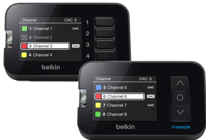
ClientCube Desktop Control Unit 4 Port or 8 Port DCU Switch

Instantly have access to multiple networks and resources. Small form factor remote control for the ClientCube NET-4 and NET-8.