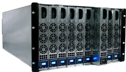
A3100 front open, one blade pulled